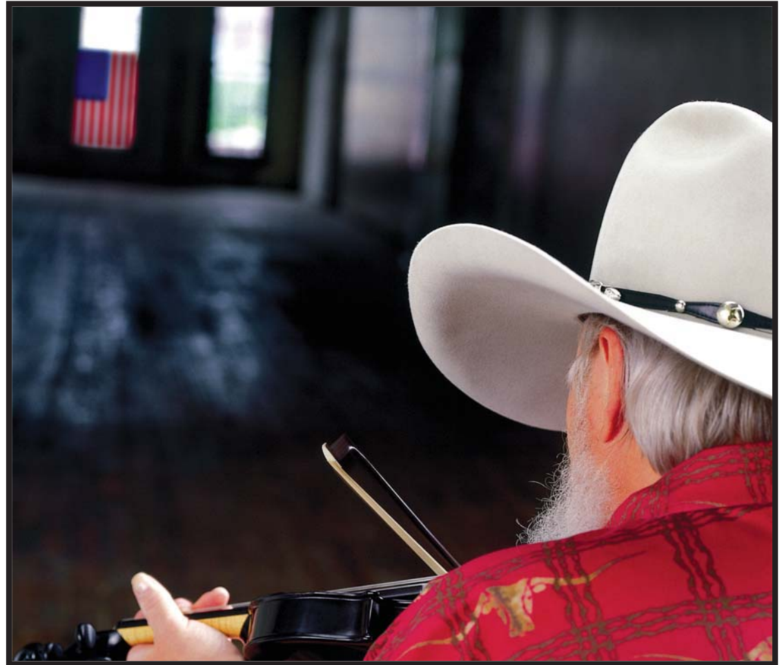
Charlie Daniels

"For years Nashville seemed as far away as the moon," recalled Daniels, who openly conceded that he never dreamed he would ever enjoy the level of success that has come to pass. "I couldn't have even imagined what was in store for me," the legendary songwriter said.